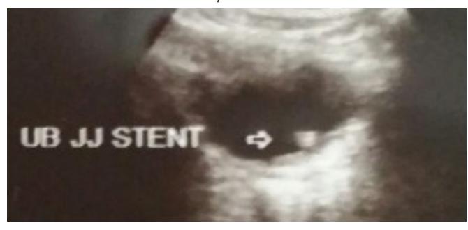
Figure 7: Post operation ultrasound shows tip of JJ stent inside the urinary bladder.

dence of a notch between them and JJ stent in the upper kidney with no evidence of stone in lower kidney.