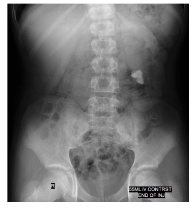
Figure 2: Nephrogram shows a large kidney in the left side of abdomen.