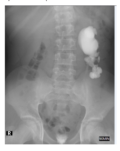
Figure 4: Single ureter with normal caliber is seen in the left side showing passage of contrast into the urinary bladder.