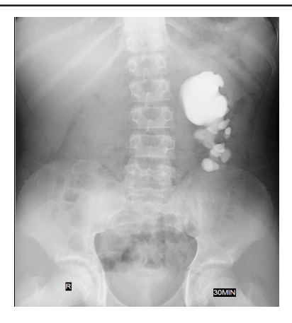
Figure 3: Significant hydronephrosis in the upper moiety with abrupt cut off at the uretero-pelvic junction and moderate hydronephrosis in the lower moiety due to renal pelvis stones.